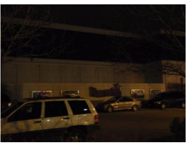
Harrah's in Joliet during Earth Hour 2011

Be part of Earth Hour, March 31 The last Saturday of March, 8:30pm to 9:30pm has been recognized as Earth Hour since 2007 when 2.2 million residents of Sydney, Australia participated by turning off all non-essential lights. The event went global as a way for homes and businesses to raise awareness of the amount of energy we use. Earth Hour 2012